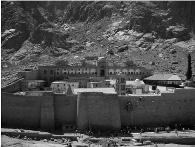
Fig. 4 for Question 4

St. Catherine's Monastery is an Orthodox monastery on the Sinai peninsula at the base of Mount Sinai in Egypt. One of the oldest Christian monasteries in the world, St. Catherine's includes the burning bush seen by Moses and contains many valuable religious icons. This area is sacred to three world religions: Christianity, Islam and Judaism.